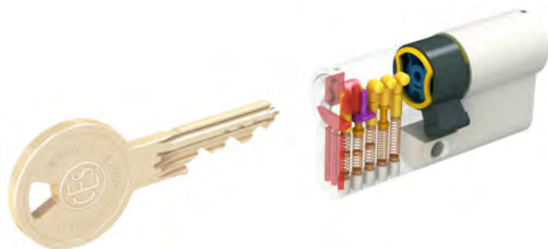
(Fig.: 5 pins system)