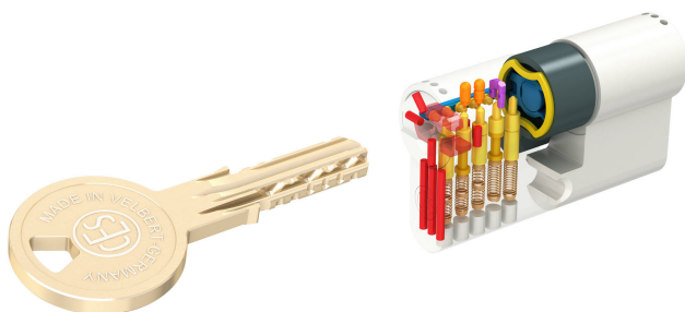
(Fig.: 5 pins system)

*Only with 2 spring-loaded turning lever